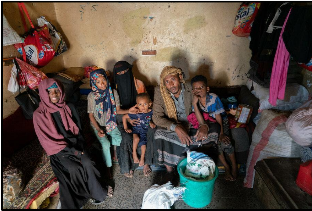
A typical Yemeni family struggling to survive.