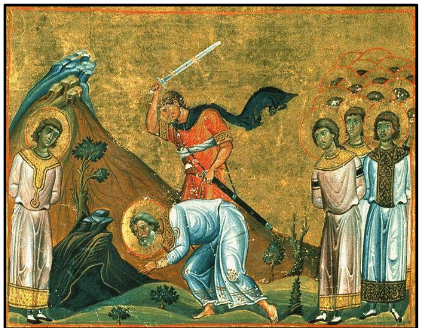
Orthodox iconography of the martyrdom of St. Arethas

Thousands of believers who refused to deny Christ were subject to torture by their Jewish persecutors, some one hundred years before the rise of Islam. The leader of the Christian community of Najran at the time, Harith (Arethas), was a beloved and respected elder. The devastating