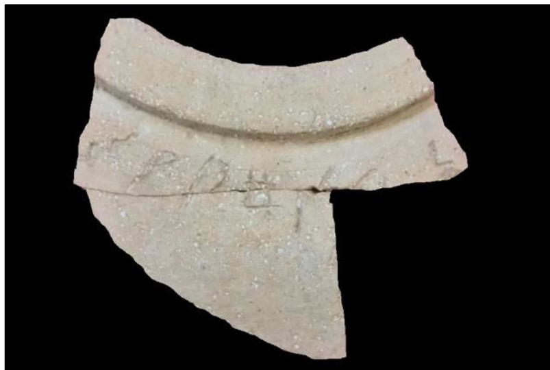
Pottery shard written in the Sabaean language that dates to the time of King Solomon and the Queen of Sheba, found in

Although some scholars suppose that the Queen of Sheba is from Ethiopia, there is a strong basis for locating Sheba in Southern Arabia. The remains of the palace of the Queen of Sheba may be at an archaeological site in Marib, Yemen. One of the best-preserved buildings in the ruins, the Bar'an Temple (also known as the Throne of Bilqis), may be the ancient palace. Sumharam at Khor Ruri in southern Oman, now a UNESCO World Heritage Site, is supposedly the summer palace of the Queen of Sheba. It is possible that Yemen, Eritrea, and Ethiopia at one time may have been joined by one ruling power or kingdom; therefore, the kingdom of Sheba may have spanned the Red Sea. Nonetheless, the oldest writings of Sabaean [Sheba] language on rocks comes from Yemen, not Ethiopia. The Sheba of Isaiah also seems linked closely with Oman, Yemen, and Saudi because the other four nations from Isaiah 60 are in the Arabian Peninsula.